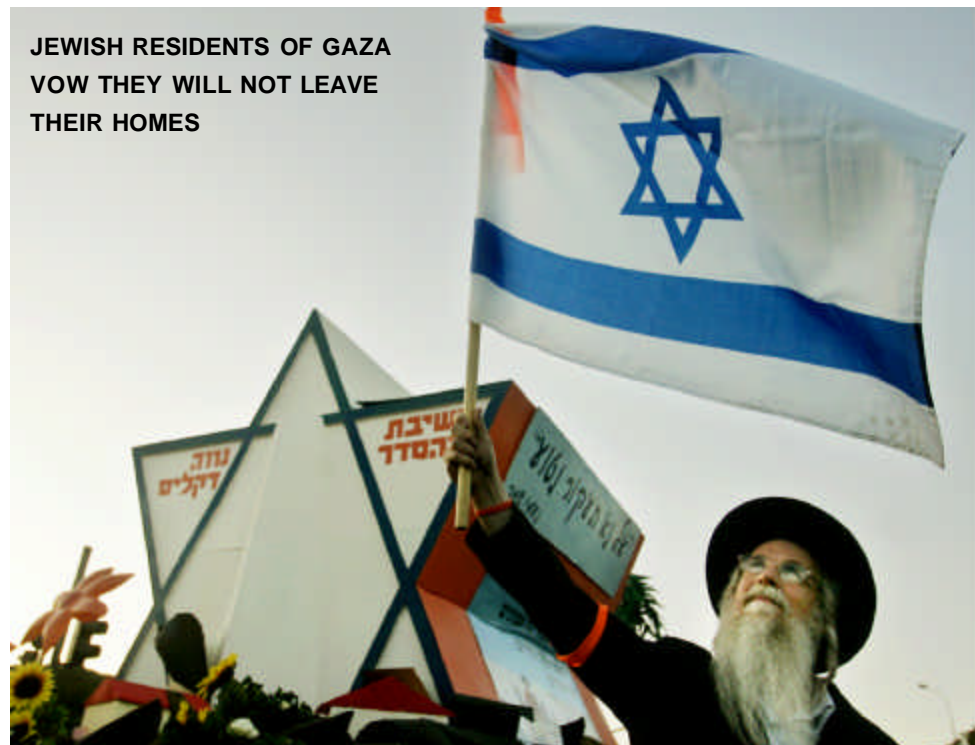
JEWISH RESIDENTS OF GAZA VOW THEY WILL NOT LEAVE THEIR HOMES

11. ISRAELI EXTREMISM - However that rebellious extremism is also manifested in the extremism within Israeli society. That extremism has three basic forms: leftist